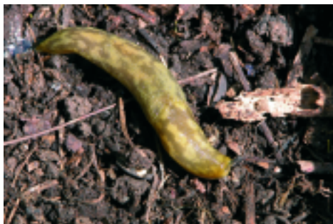
leopard slug -S. Tatman

A ring of sharp grit, crushed egg shells, pine needles, coffee, ash or soot around a plant can help keep slugs and snails away. A mulch of cocoa shell is also worth a try. The mulch will also suppress weeds and help retain soil moisture.